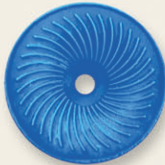
After 1500 loads