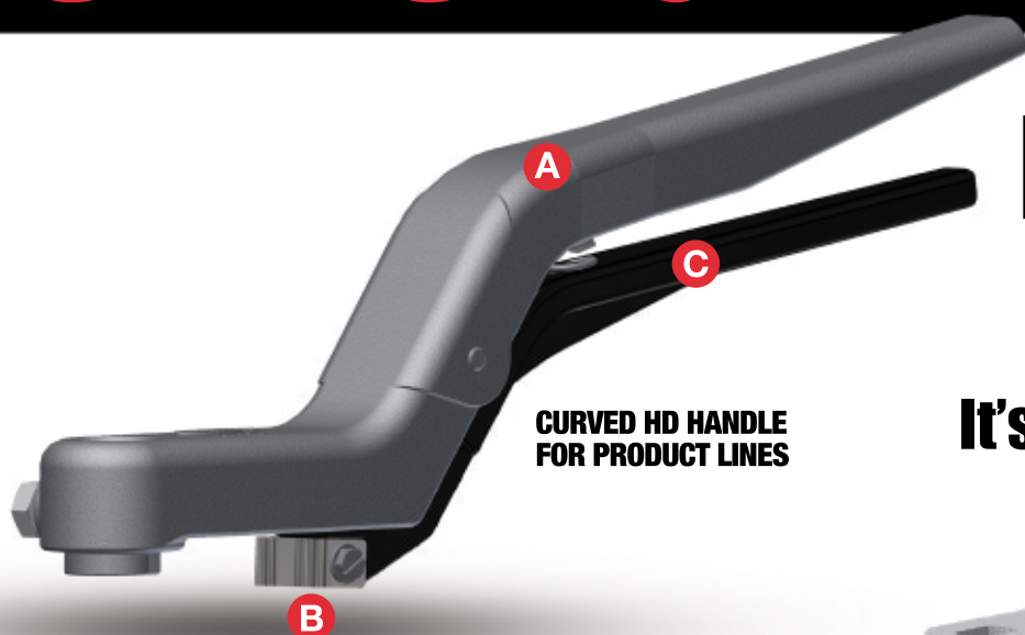
CURVED HD HANDLE FOR PRODUCT LINES

BTI's HD™ Valve Handle. It's the Definition of tough.